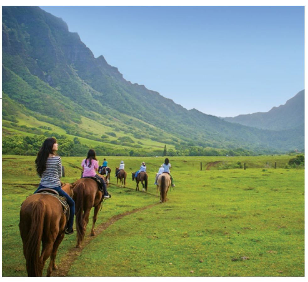
▲ See the spectacular scenery of "Jurassic Valley" on horseback in Kualoa Ranch.

Wander through 42 acres of tropical splendor and enjoy the adventure of traditional handson activities. Dine like royalty at an authentic Polynesian luau and top it off with the most spectacular evening show in the islands.