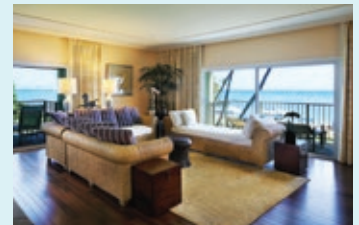
Kahala Kai Suite