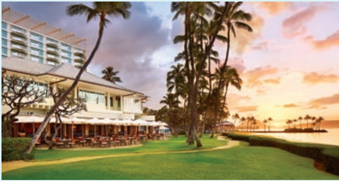
Plumeria Beach House