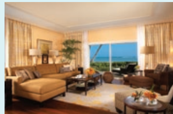
Kahala Beach Suite