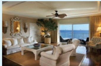
Presidential Suite (and Tower Suites)